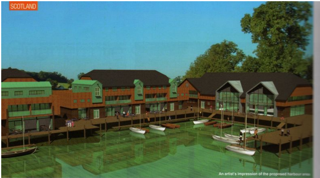
An artist's impression of the proposed harbour area.