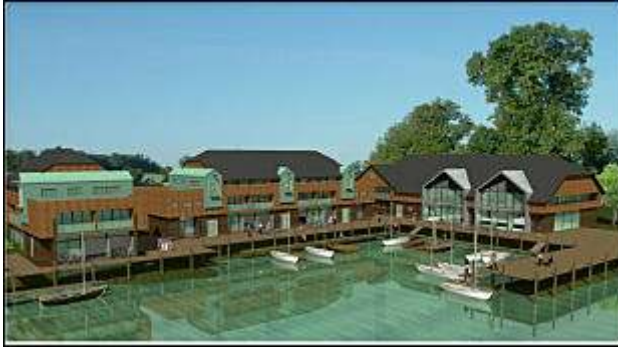
Plans for the harbour in Galston

Allseasons at the meadows , an ecological tourism development at Galston, near Kilmarnock, that will include affordable housing, has launched a new website to highlight the next steps for the development.